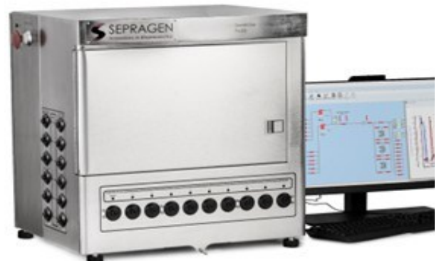
Flow Range up to 1800 ml/min

QuantaSep® Trusty is a fully integrated system to truly automate your purification process. This sanitary bench top system enables the user to automatically equilibrate, load, wash, elute and regenerate up to three columns. The user can also control each step in the purification based on UV, pH, conductivity, time, temperature, air sensors or any external user-defined variable. As the sensors monitor column outflow, the computer reads the information to automatically change buffers, start gradients and collect fractions, stepping through the method as you programmed it. The computer logs all data, such as events, alarms and chromatograms for analysis and printout.