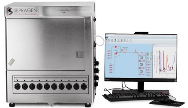
Flow Range 1-100 ml/min

QuantaSep® Trusty 100 is a fully integrated system to enable methods development, validation studies, scale-up/ scale-down studies and troubleshooting on a bench scale. With its powerful and easy to use Windows® based software, it allows the user to automatically equilibrate load, wash, elute and regenerate up to three columns. The user can also control each step in the purification based on UV, pH, conductivity, time, temperature, air sensors or any external user-defined variable. As the sensors monitor column outflow, the computer reads the information to automatically change buffers, start gradients and collect fractions, stepping through the method as you programmed it. The computer logs all data for analysis and printout.